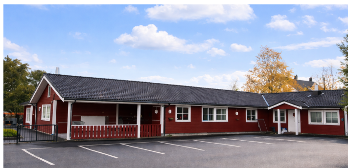
Trollhaugen Kindergarten in Ålesund is a private kindergarten established in 1990. It consists of two buildings with seven departments and approximately 130 children. The kindergarten is surrounded by forest, sea and mountains, providing rich opportunities for exploration both indoors and outdoors.

We have been inspired by the Reggio Emilia philosophy since 2009. This philosophy aligns with our view of the child and how we wish to shape everyday life together with children. We draw inspiration from its core ideas and ways of working, and develop our practice based on our own context, culture and framework conditions.