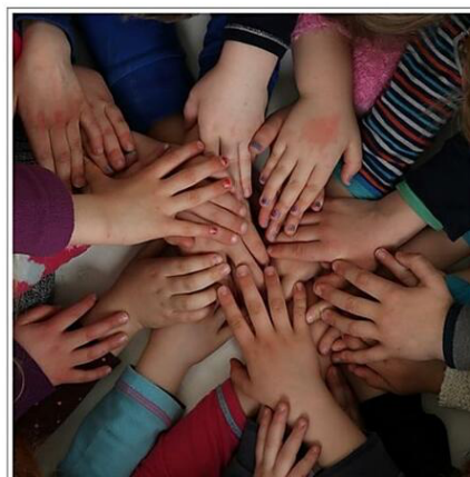
- The hundred Languages - Loris Malaguzzi

ET BARN VEI LØSER ALV HUNDRE BARN NEI TAR HUNDRE SPRÅK HUNDRE HENDER HUNDRE TANKER HUNDRE MÅTER Å TENKE PÅ Å LEKE OG SNARKE PÅ HUNDRE ALLTID HUNDRE MÅTER Å LITTE I HUNDRE-Å STINESOM HUNDRE LISTER Å SYNGE UGFORM HUNDRE VERDEN ER Å OPPDAGE HUNDRE VERDEN Å OPPFINNE HUNDRE VERDEN ER Å DRØMME FRA ET BARN HAR HUNDRE SPRÅK OG DERTIL HUNDRE HUNDRE MEN BEHOVES NÅTTINGI SKOLEN OG KULTUREN SKILLER HODET FRA KRAPPEN MAN BER BARN Å TENKE UTEN HEN DER Å HANKE UTEN HODE Å LYTTEN MEN IKKE SNARKE Å BEGRIPPE UTEN GLEDEN I Å HENTHØRDES OG OVERRASKE ANNET ENN TIL PÅSKE OG JUL MAN SER TILDEI: AT LEKE OG ARBEIDE DET VIRKELIGE OG DET INNVIKLEDE VITENSKAPELIG OG FANTASIKK HUNNELEI OG BORDEN FORNUFTENS DRØMMENE ER FORETELSER SOM IKKE HENGER SAMMEN MAN SER TILDEI: AT DET IKKE FINNES HUNDRE MEN BARNET SER TVERT IMOT DET ER HUNDRE SOM FINS